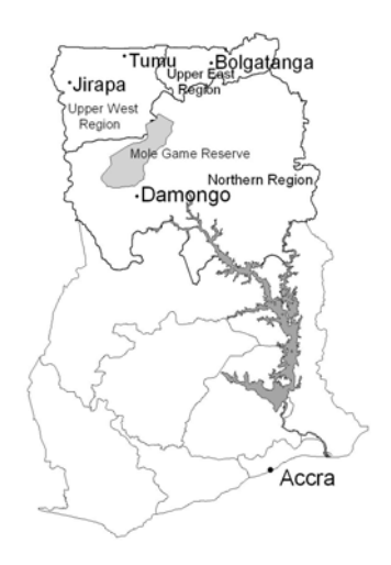
Figure 1 Map of Ghana showing the study sites

The study was carried out in four towns: Damongo (Northern region), Jirapa and Tumu (Upper West region) and Bolgatanga (Upper East region) of Ghana (Figure 1) during the wet (June-October) and dry (November-May) seasons of 1999 and 2000. The towns were selected on the basis of previous histories of outbreaks of yellow fever and suspected viral haemorrhagic fevers. These areas are characterized by prolonged dry season and a short rainy season covering about five months with annual rainfall under 900mm. Bolgatanga is more cosmopolitan and serves as the Upper East regional capital. Damongo is about 30km from Mole, the biggest game reserve in the country. The game reserve is about 300km<sup>2</sup> and harbours different species of animals including chimpanzees, baboons and elephants. Damango and Jirapa are served by Catholic mission hospitals while Tumu and Bolgatanga have Ghana Government hospitals. The vegetation in all these area is typical sahel savannah with short trees including baobab and shea butter trees and long grass.